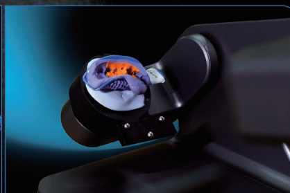
Post and Core